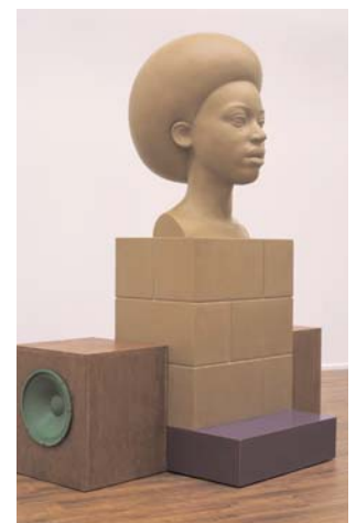
Dub Monument 2004