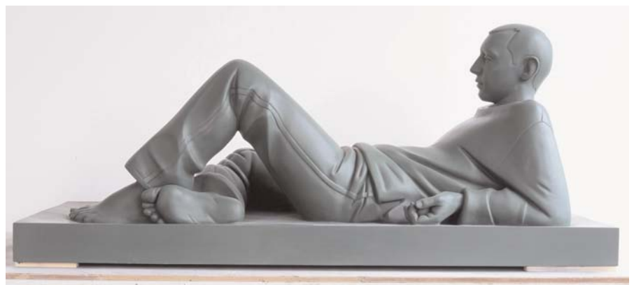
Youth With Split Apple 2005