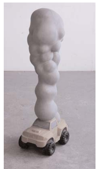
I ♥ Rapid Change 1 2005