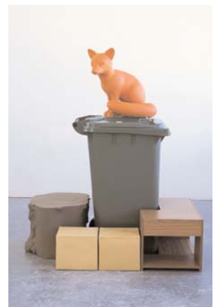
Fox 2004 (one of the Animal Virtues series)