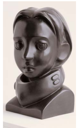
Anomie (Bronze the retrospection) 2005