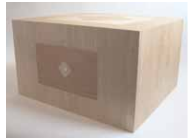
Perspection box II