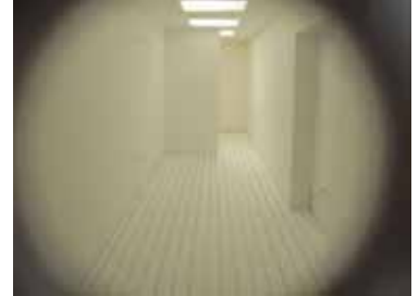
Perspection box interior